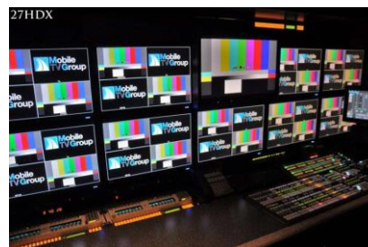
27HDX Dual Side Production