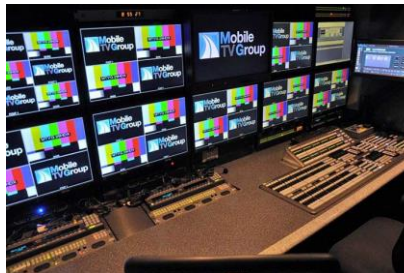
29HDX Dual Side Production