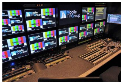
29HDX Dual Side Production