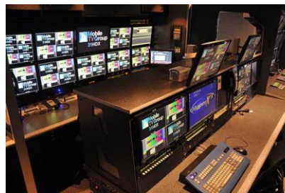
31HDX Visitor Production – Kayenne Switcher