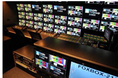
31HDX Production – Kayenne Switcher