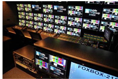
31HDX Production – Kayenne Switcher