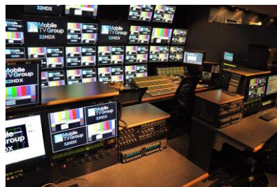
32HDX Production – Kayenne Switcher