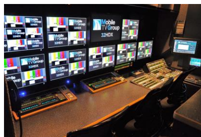
32HDX Visitor Production – Kayenne Switcher