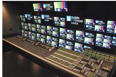
34HDX Production – Kayenne Switcher