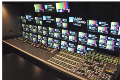
34HDX Production – Kayenne Switcher