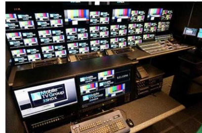
35HDX Production – Kayenne Switcher