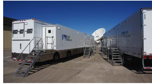
37HDX & 37VMU Exterior