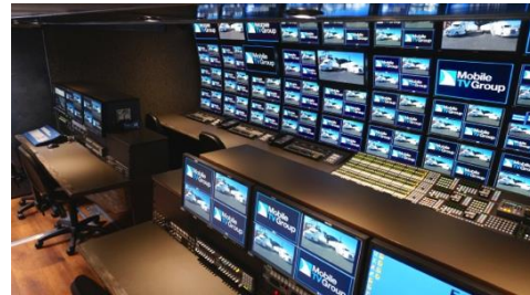
37HDX Production – Kayenne Switcher