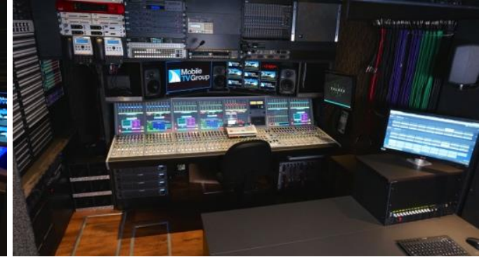
Audio- 37 HDX