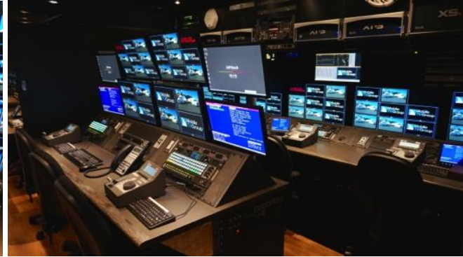
Audio- 37 HDX