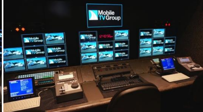
Replay- 37 VMU