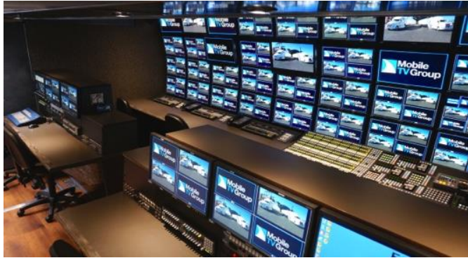
Replay- 37 HDX