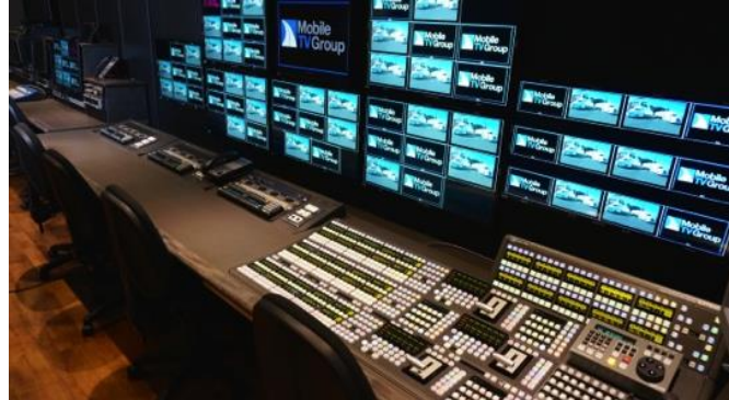
Replay- 37 VMU