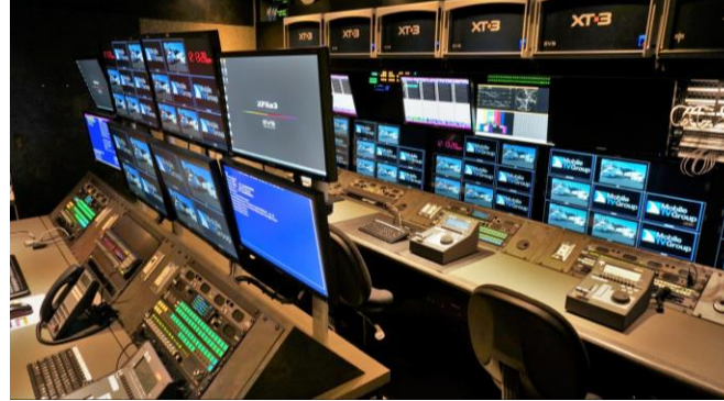
Audio- 38 FLEX