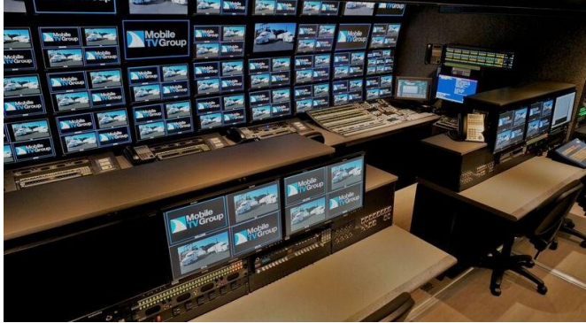
Replay- 38 FLEX