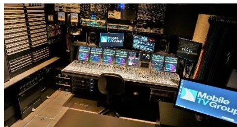
38 FLEX Audio