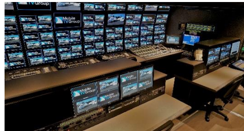
38 FLEX Production – Kayenne Switcher