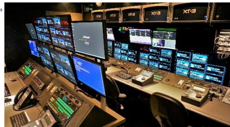
38 FLEX Replay