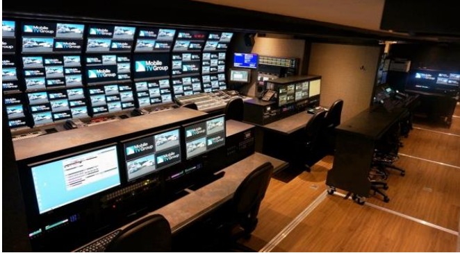
Replay- 40 HDX