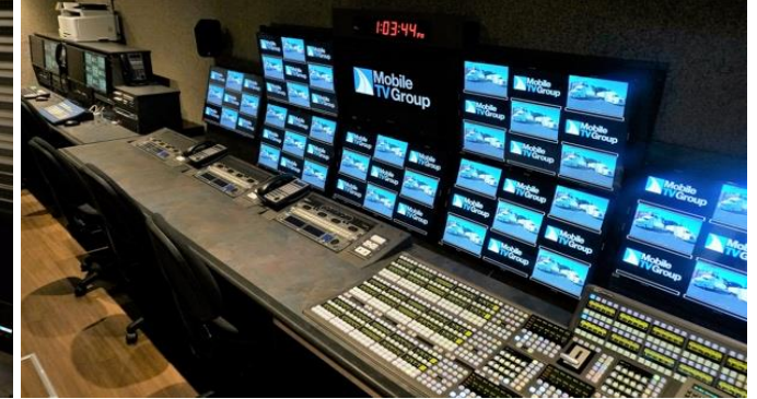
Production- 40 HDX