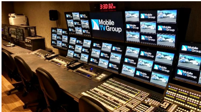
Replay- 42 FLEX