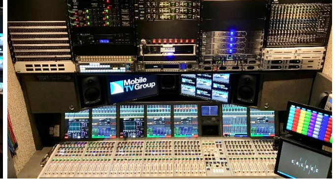
Production- 42 VMU