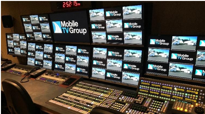
Production- 43 VMU