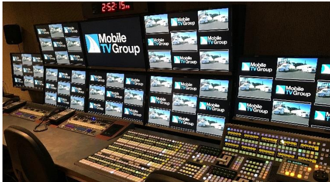
Replay- 43 VMU